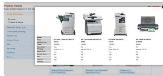
Figure 2. With Oracle BigMachines CPQ eCommerce Transactions Cloud Service, you can select products for side-by-side comparison.

Oracle BigMachines CPQ eCommerce Transactions Cloud Service offers multiple ways to guide the selection process for your customers. Scroll through product images or use enhanced search filters to narrow your product search. Or use the comparison feature to view products or services side by side to compare features, prices, and options.