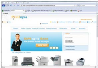
Figure 1. Use Oracle BigMachines CPQ eCommerce Transactions Cloud Service to create a powerful B2B e-commerce site with the user-friendly look of a consumer site.

Oracle BigMachines Configure, Price, and Quote (CPQ) eCommerce Transactions Cloud Service enables you to build a self-service, online business-to-business (B2B) guided selling and configuration platform for your customers to shop on. With it, your customers can access the same tools used by your sales channels for internal quoting and proposal development. Streamline your sales process while enabling direct selling to business customers on your website.