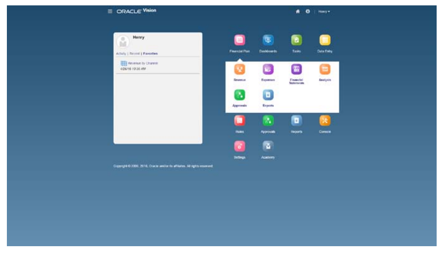
Figure 2: The intuitive, mobile-ready interface of Oracle Planning and Budgeting Cloud

Oracle Planning and Budgeting Cloud Service uses modern html5- based browser interface to enable business users to easily view plans and reports on the web or on their mobile devices. The interface's capabilities are kept consistent with other Oracle Cloud Solutions to ensure a similar look and feel. Robust dashboard and report creation capabilities are provided to enable complete planning, analysis and reporting capabilities all within the same solution.