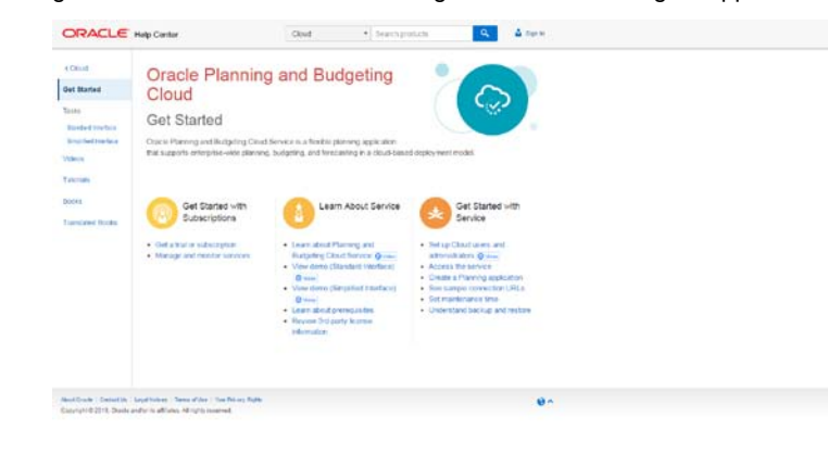
Figure 4: Online help and best practice guides speed implementation and adoption

In today's dynamic business environment, organizations cannot afford lengthy implementation cycles and need to get up and running quickly on their new software applications. Oracle Planning and Budgeting Cloud Service incorporates a number of cloud-specific features to make it extremely easy to get users up and running with virtually zero training needed. These include a built in capabilities like multi-currency translations, time series spreading based on calendar definition, large amount of online help and tutorials, as well as best practice templates and guides. To simplify administration, Oracle Planning and Budgeting Cloud Service includes diagnostics and governors that assist with monitoring and troubleshooting an application.