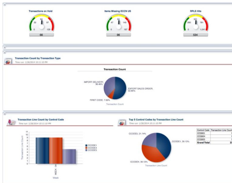
Figure 1. Dashboards can be configured to highlight key compliance metrics

With user-friendly and easily customized screens, GTI provides actionable insight that helps ensure the right decisions are being made.