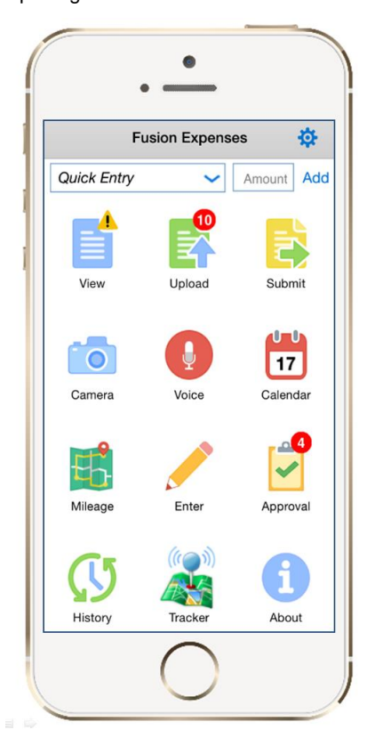
Figure 2: Integrated Fusion Mobile Expenses

Today's users demand ERP systems reflect the ubiquity of digital technology they experience in their personal lives. To accommodate the increasing reliance on mobile devices, Oracle offers another entry method for expense capture, submission and approval while on the go. Fusion Mobile Expenses is a comprehensive solution supporting mobile entry for both iPhone and Android devices, leveraging common smartphone features such as photo capture for automated expense entry of receipts, voice capture to record expenses, GPS route tracking to calculate mileage, and multicurrency and location-based support using GPS location. Other innovative features use your contacts and calendar to select attendees for meals or other expenses while capturing the receipt on the spot and downloading credit card transactions. It's all in your smartphone so you can easily sync with Oracle Expenses Cloud for expense reporting.