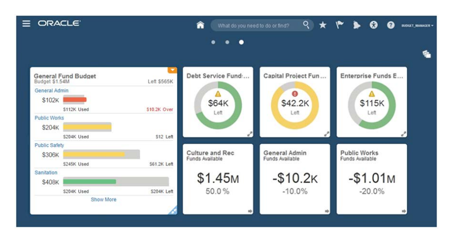
Figure 2. Budgetary Control Infolets