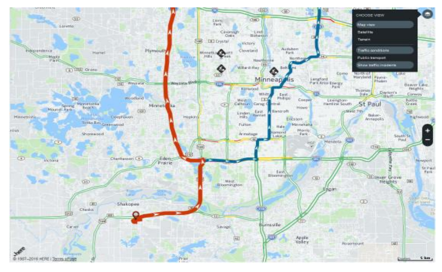
Figure 2: Oracle Fleet Management Cloud also provides street-level route considerations, with the option to display real-time traffic, traffic incidents, and weather.